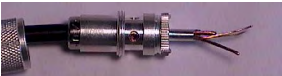
Adapter screwed into

connector body and ready to solder braid