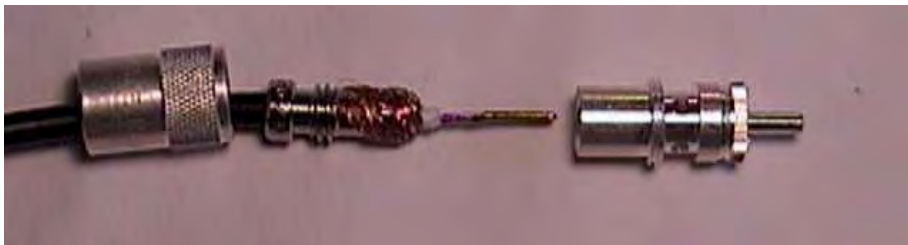
Braid folded back over