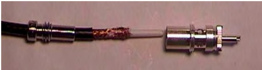
Thin coax with adapter

If you are installing the PL-259 onto RG-8X or other cable with a smaller than 0.402 outside diameter, you will need a reducing adapter to compensate for the smaller cable. In this case, the braid will need to be folded back around the adapter as illustrated below.